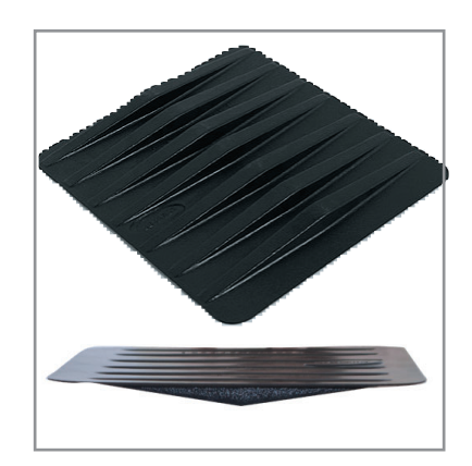
Cushion Rigidizer – lightweight and low profile